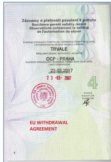
Figure 2 residence permit with the “EU Withdrawal Agreement” entry

From 2 August 2021, the Ministry of the Interior will issue documents with biometric data, which will include the note “Art. 50 of the Treaty on European Union” or “RP UK – Article 50 of the Treaty on European Union”).